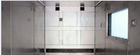
WALK-IN TEST CHAMBERS