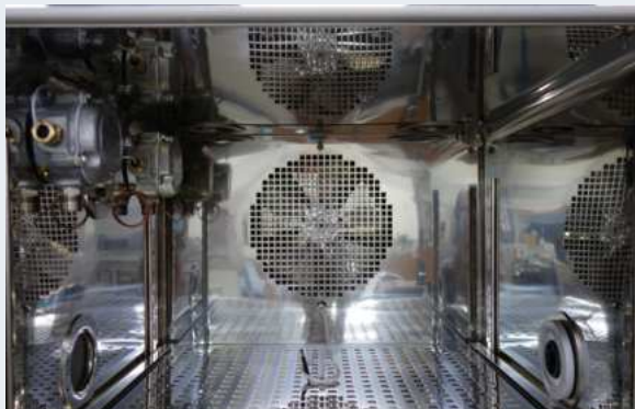
GAS SENSORS, FIRE DETECTORS