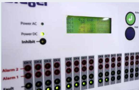
SAFETY CONTROL SYSTEMS PLC