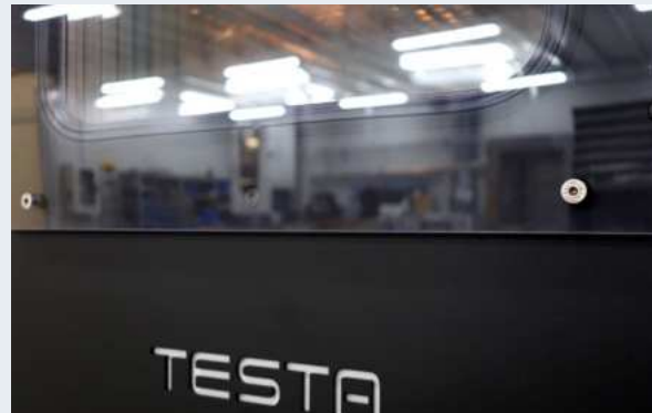
POLYCARBONATE WINDOW PROTECTION