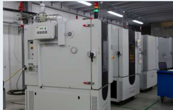
TESTA ATEX CHAMBER