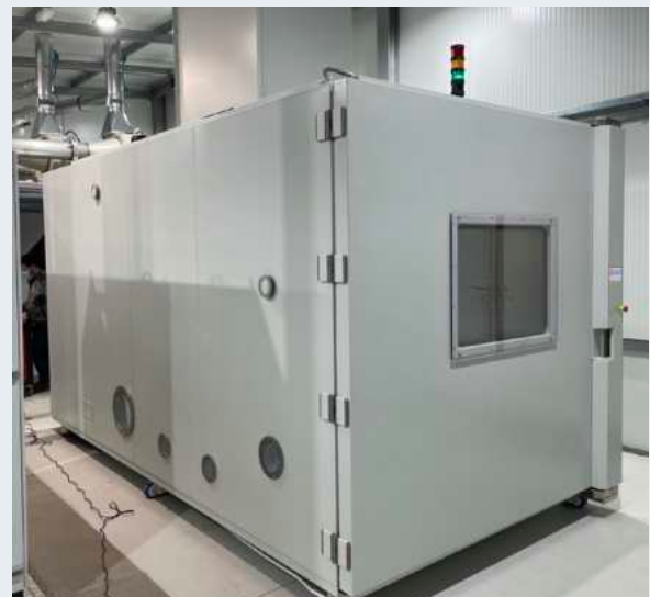
EUCAR ATEX WALK-IN CHAMBERS