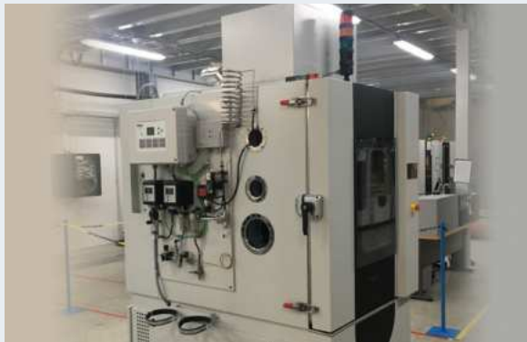
TESTA BATTERY TESTING CHAMBER