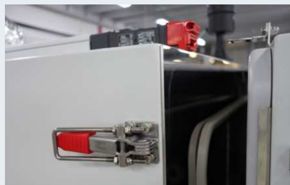
MAGNETIC DOOR LOCK AND MANUAL LATCHES