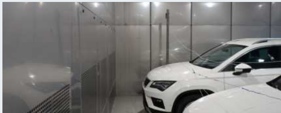
DRIVE-IN AUTOMOTIVE TESTING

If you find that standard test chambers don't meet your size needs, or your testing requirements demand a custom solution, Aralab provides you with an extensive range of options. As a comprehensive solution provider, we engineer and build testing chambers and rooms from walk-in test chambers to vehicle-sized test rooms, allowing for expansive testing space. Furthermore, our portfolio expands to include test systems for solar radiation, temperature shock, ATEX protection chambers, vibration tests, and multi-axial shaker tables (MAST).