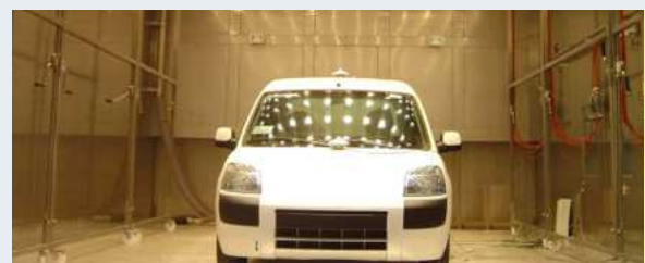
SUN SIMULATOR DRIVE-IN