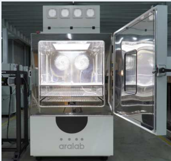
SOLAR AND UV RADIATION CHAMBER