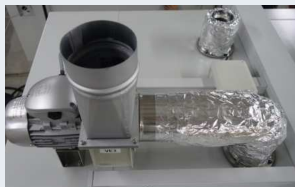
FLUSHING / PRESSURE RELIEF SAFETY